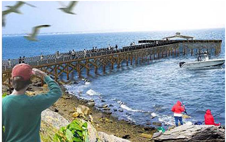
Rendering of 280-foot long T-shaped pier with shade structure, benches and railings. Railing heights will vary to allow people of all ages to see and access the water.