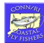
CT/RI Coastal Fly Fishers