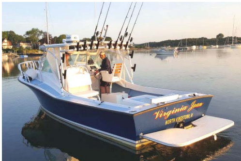
The Virginia Joan is a 26' Bonito