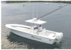
32' Center Console

Family Favorite Inshore Reef Fishing YOU NEVER KNOW WHAT YOU WILL CATCH.... Flounder, Porgy, Sea Bass, Black Fish, Striped Bass, Bluefish...even Sharks And Best of All VERY AFFORDABLE!!