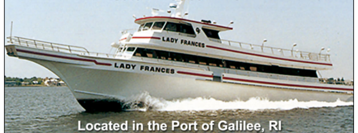
Located in the Port of Galilee, RI