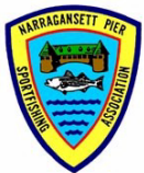
Narragansett Pier Sportfishing Assoc.