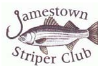
Jamestown Striper Club