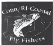
CT/RI Coastal Fly Fishers