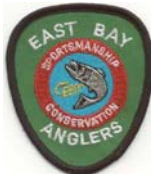
East Bay Anglers