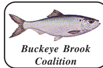
Buckeye Brook Coalition