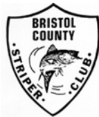
Bristol County Striper Club