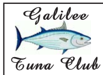
Galilee Tuna Club