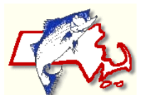
Massachusetts Striped Bass Assoc.